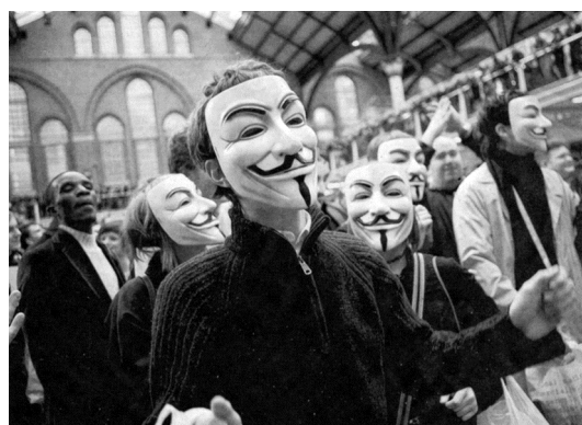
The weird phenomenon of flash mobs

7 "Why not?" say the Californians. "This is paradise, the individual set free."