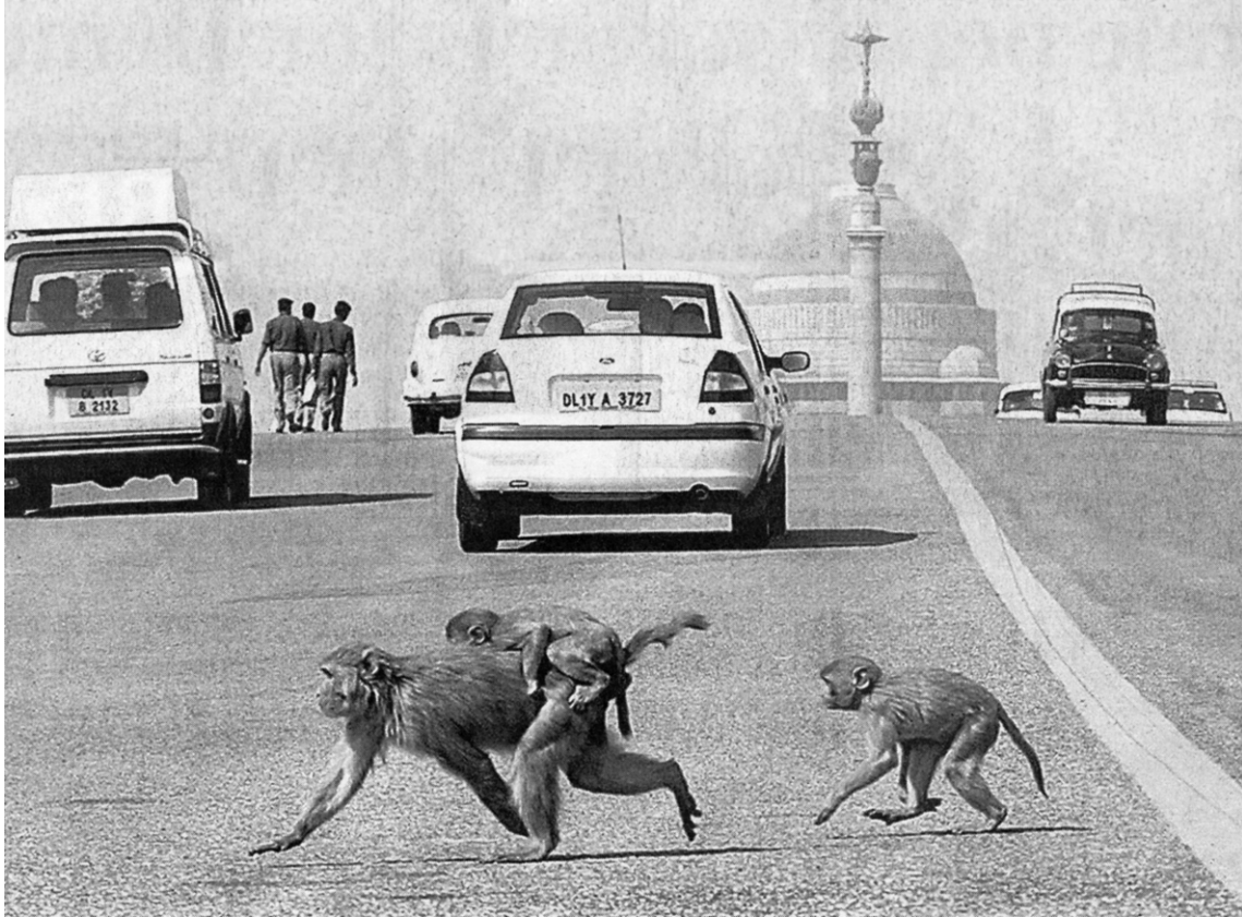
Monkeys cross the road outside the presidential palace in Delhi.