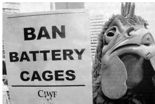
An animal rights activist protests European Union farm policy in Brussels.

label those who attempt to defend these animals as dangerous, misguided radicals, dismissing every argument for mercy? And how precisely did Christianity and conservatism become allied with an agriculture industry that treats food animals as so many production units whose growth and slaughter are to be maximized no matter what the cost?