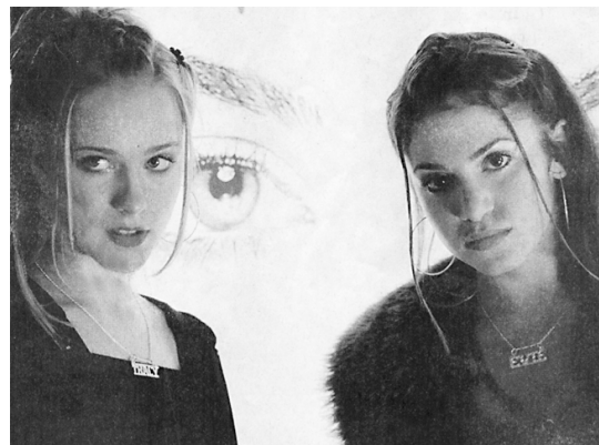
Evan Rachel Wood (Tracy) and Nikki Reed (Evie) in thirteen

piercing, promiscuity and petty crime, are based on this episode in Reed's life.