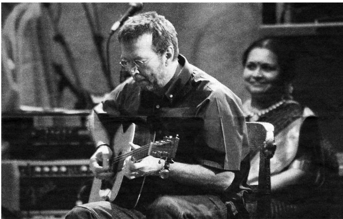
Remembering a Beatle ... guitarist Eric Clapton at the Royal Albert Hall