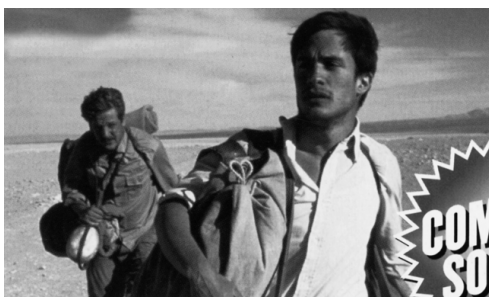
Revolutionary road: Bernal as Che Guevara