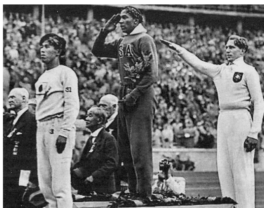
Victorious... Jesse Owens with the gold medal for long jump, flanked by Naoto Tajima of Japan and Germany's Lutz Long, at the Berlin Olympics, 1936

7 At times, both Owens and Louis had to descend to vaudeville to survive – Owens running races against horses, Louis hamming it up as a professional wrestler. No wonder, looking back at their careers, a later and more militant generation of African-Americans scoffed at their futile attempts to placate the white man. Joe and Jesse did everything that was asked of them, and more, and they still ended up short-changed and demeaned.