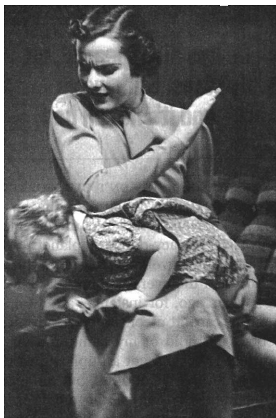
BAD OLD DAYS? Not necessarily. In certain situations, say many pediatricians, a whack on the bottom may be good parenting